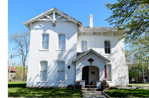
★ McGovern House 415 E. Washington

Built in at least 1875 – but likely earlier – the McGovern House is one of the oldest residences in Kirksville. It is currently in the process of being restored by its owners.