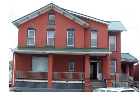
★ Spencer Selby House 316 N. Franklin