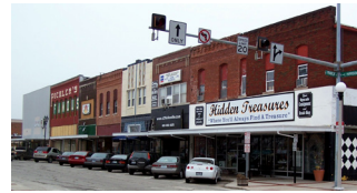
★ Courthouse Square Historic District 100 Block of W. Harrison

Building began in this district in 1883. As the only historic district in Kirksville, this area contains wonderful examples of historic architecture, such as Art Deco and Romanesque Revival. A notable building in this district is Pickler's Famous, a Local Historic Landmark.