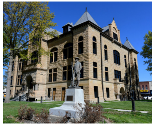
★ Adair County Courthouse 106 W. Washington

The present courthouse was constructed in 1898. The courthouse has several carved Grotesque faces located near the steps; see if you can spot them! The courthouse received substantial renovations from 2021 to 2023.