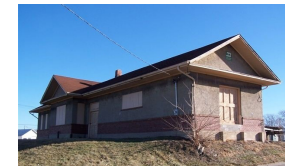
★ CB&Q Railroad Depot 904 N. Elson

Built before 1906, this railroad depot is one of the only two depots left in Adair County. The depot served as Kirksville's main location for railroad transportation.