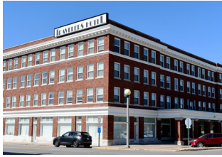
★ Travelers Hotel 301 W. Washington

Built in 1923, the Travelers Hotel served as a hotel until 2007. The hotel was an important feature in the social scene of Kirksville until the 1980s. Currently, the building operates as downtown apartments.