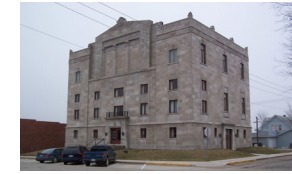
★ Masonic Temple 217 E. Harrison

Built in 1930, the Masonic Temple is the most architecturally unique building in Kirksville. This Great Depression era building was constructed in the Egyptian Revival style, and is the only one of its kind in the city. This building is still used by various Masonic bodies.