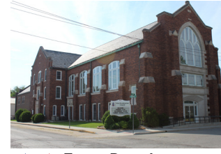
★ ★ First Presbyterian Church 201 S. High

The First Presbyterian Church was constructed in 1922-1923 and designed by local architect, Irwin Dunbar. The property was placed on the National Register in 2016 and was later included as the 10th City of Kirksville local landmark in 2017. The church is a local example of late 19th and 20th Century Tudor and Jacobean Revival styles.