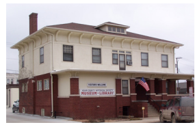
★★ Adair County Historical Society 211 S. Elson

The Adair County Historical Society's building was originally constructed in 1916 as the meeting place for the Kirksville Sojourners Club. The Sojourners Club, first organized in 1897, is the oldest women's club in Kirksville. Today, the historical society uses the building to house its collection of Kirksville and Adair County artifacts.