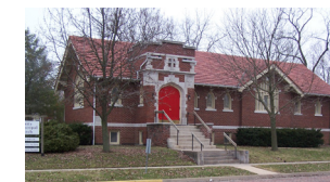
★★ Trinity Episcopal Church 124 N. Mulanix