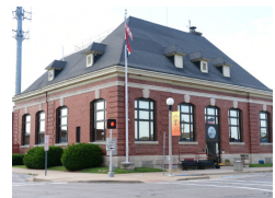
★ Kirksville City Hall 201 S. Franklin

Built in 1930, the Masonic Temple is the most architecturally unique building in Kirksville. This Great Depression era building was constructed in the Egyptian Revival style, and is the only one of its kind in the city. This building is still used by various Masonic bodies.