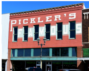
★ ★ Pickler's Famous 114 W. Washington