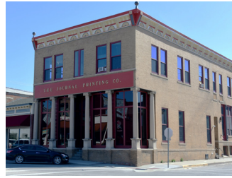
★ The Journal Printing Company Building 119 S. Elson

In 1905, this structure was built to house the printing shop of the Journal Printing Company. The company remained in this building