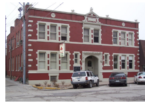
★★ Grim Building 113 E. Washington

Though more than 100 years old, the Grim Building continues to fulfill its original purpose as a commercial building.