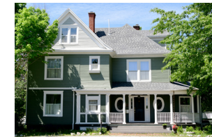
★ Evans House 1003 E. Illinois

Property records date back to 1847, with the home being built between 1886 and 1900. A few high-profile residents